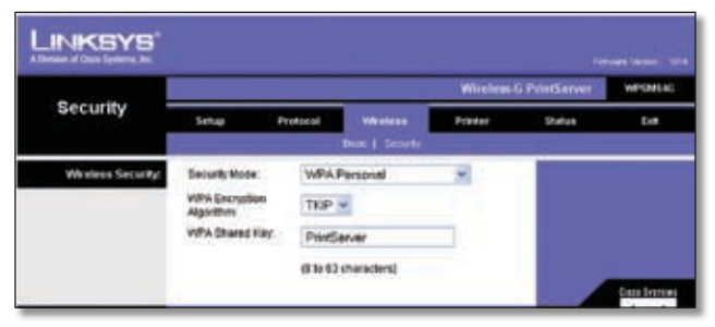
Wireless > Security > WPA Personal > TKIP

WPA Encryption Algorithm TKIP is the default algorithm. AES is also available.